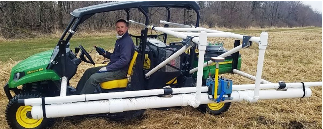
EM geophysical unit on Gator UTV.

The goal for the 2023 fall survey season included 25 levees and 12 levee sponsors split between western, central, and eastern Iowa. IGS dedicated one staff member working full time and three additional staff members working part time on the project, resulting in approximately 520 hours of work to complete the physical survey of the selected levees. Major tasks included communicating with representative levee districts, coordinating field activities, and collecting electromagnetic geophysical data. In addition, approximately $6,000 worth of equipment use charges were included in the field efforts, including the use of the electromagnetic meter, utility task vehicle and trailer, vehicle, and GPS units.