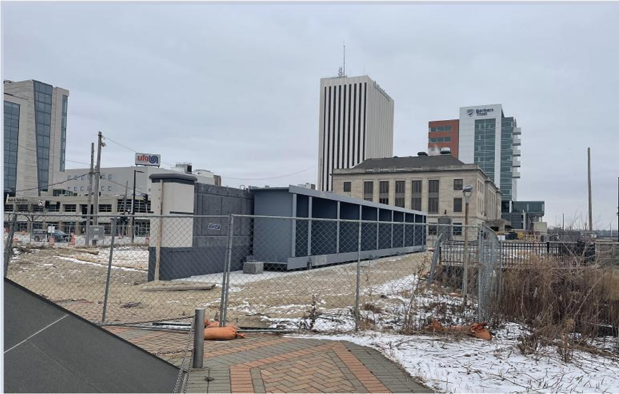
1 st Ave E Roller Gate