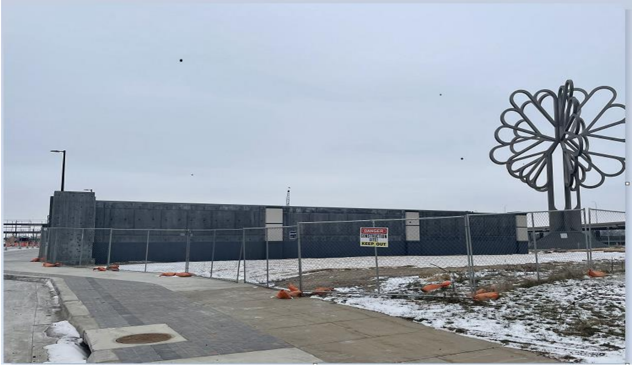
1 st Ave E Roller Gate