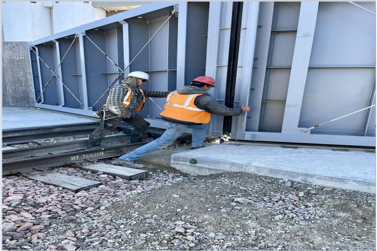
Quaker Oats Miter Gate RR Closure