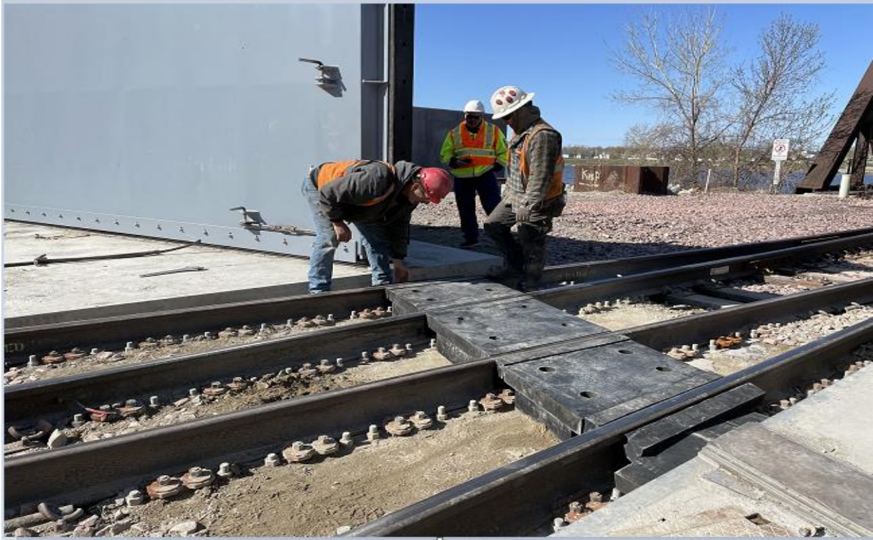
Quaker Oats Miter Gate RR Closure