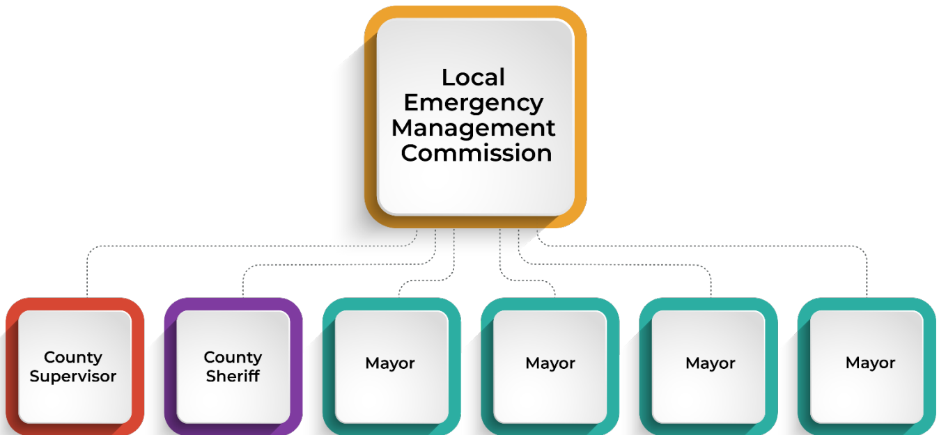
Local Emergency Management Commission Organization Chart (Figure 2):

Iowa Code § 29C.10 directs the local emergency management commission to appoint a local emergency management coordinator to fulfill the commission’s duties and responsibilities. Specific duties and responsibilities of the commission are listed in Iowa Code § 29C.9.