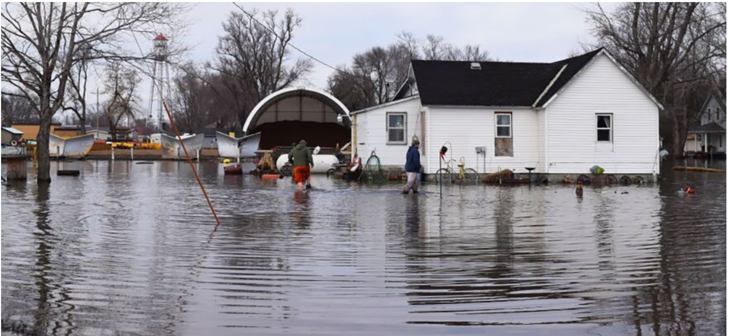
Flooding in Hornick, Iowa, in 2019.

For more information on the Flood Mitigation Program, the Flood Mitigation Board, and projects approved by the Board, visit https://homelandsecurity.iowa.gov .