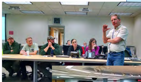
Below left; (2016) At the Linn County emergency operations center, an exercise for the Duane Arnold Energy Center. Below: (2015) An exercise for the Ft. Calhoun Nuclear Power Station, taking place in the state emergency operations center.