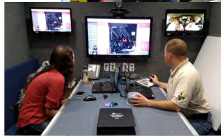
Top, left: A full-scale exercise at the Des Moines airport in 2015.