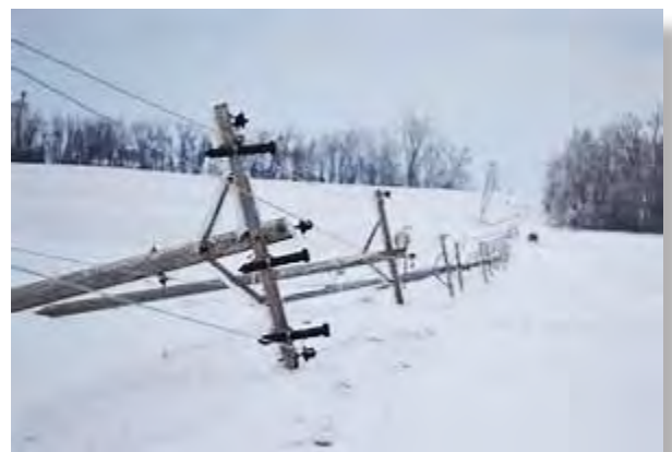
Utility poles damaged by ice storm

An April 2013 ice storm caused millions of dollars in damage to electrical utility